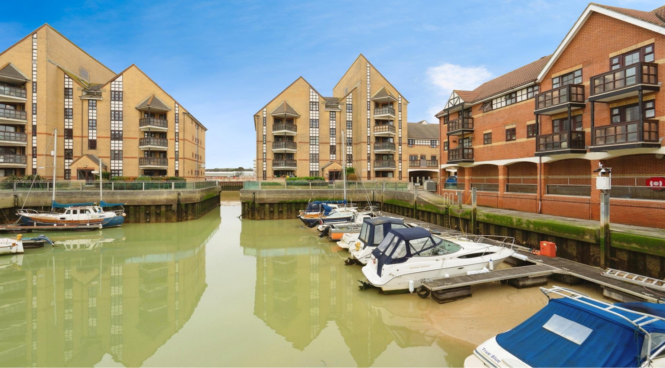
Marys Place Emerald Quay, Shoreham-By-Sea BN43 5JS