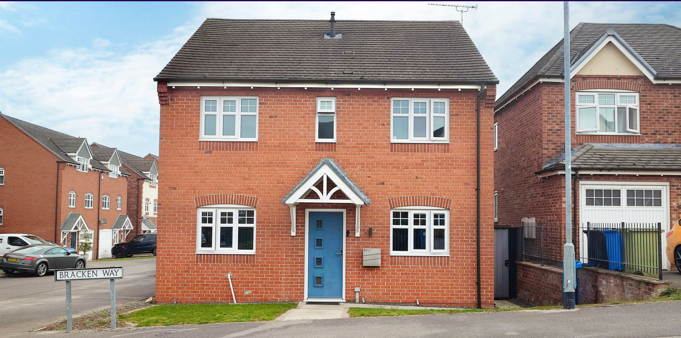
Bracken Way, Harworth, Doncaster, DN11 8SB Asking Price £260,000