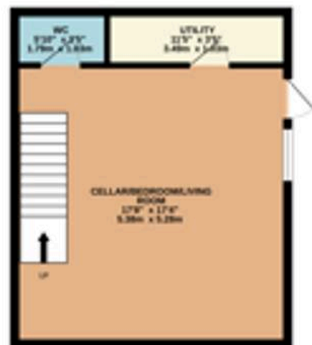
BASMENT 263 sq ft (24.3 sq m) approx.