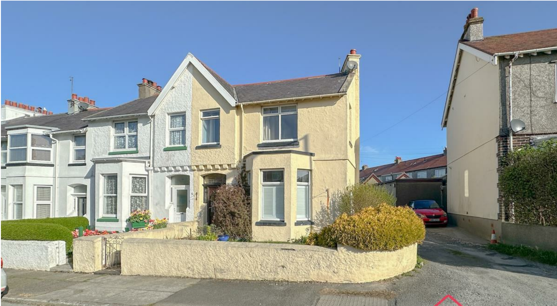
11 Royal Drive, Onchan, Isle of Man, IM3 1EY Asking Price £279,950