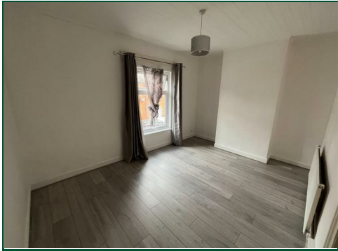
GROUND FLOOR 456 sq. ft. (42.4 sq. m.) approx.