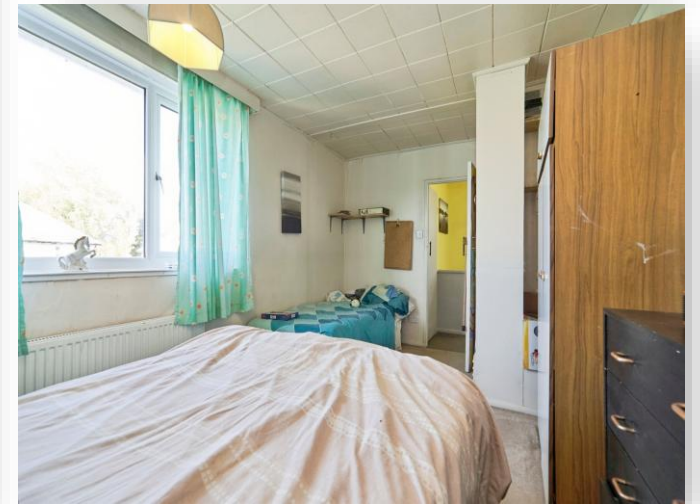
Raynel Way, Leeds LS16 6JU