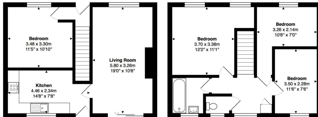
Ground Floor Area: 45.7 m 2 ... 492 ft 2

E: lettings@kendrickpropertyservices.co.uk T: 01273 699600 www.kendrickpropertyservices.co.uk