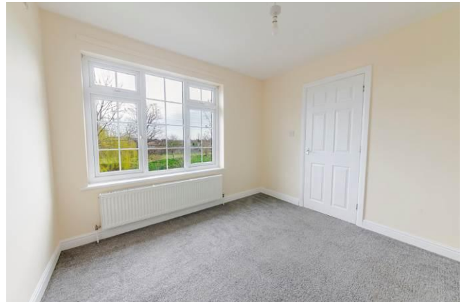
BEDROOM 3: 10' x 7' (3.05m x 2.13m) Radiator and double glazed window.