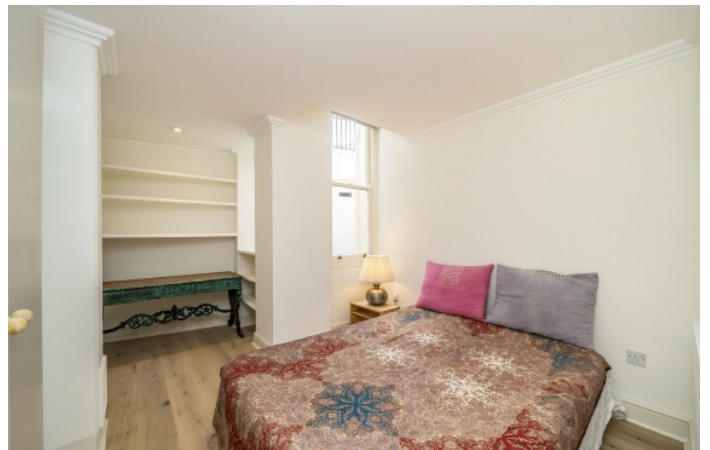
Cornwall Gardens, SW7