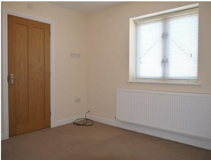
Master Bedroom 10'11" x 10'3" (3.33 x 3.12)

10' 11" x 10' 3" (3.33m x 3.12m) Double glazed window to front. TV point. Radiator.