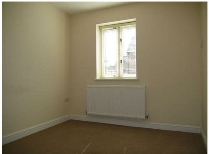
Bedroom Two 9'7" x 8'7" (2.92 x 2.62)

9' 7" x 8' 7" (2.92m x 2.62m) Double glazed window to rear. TV point. Radiator.