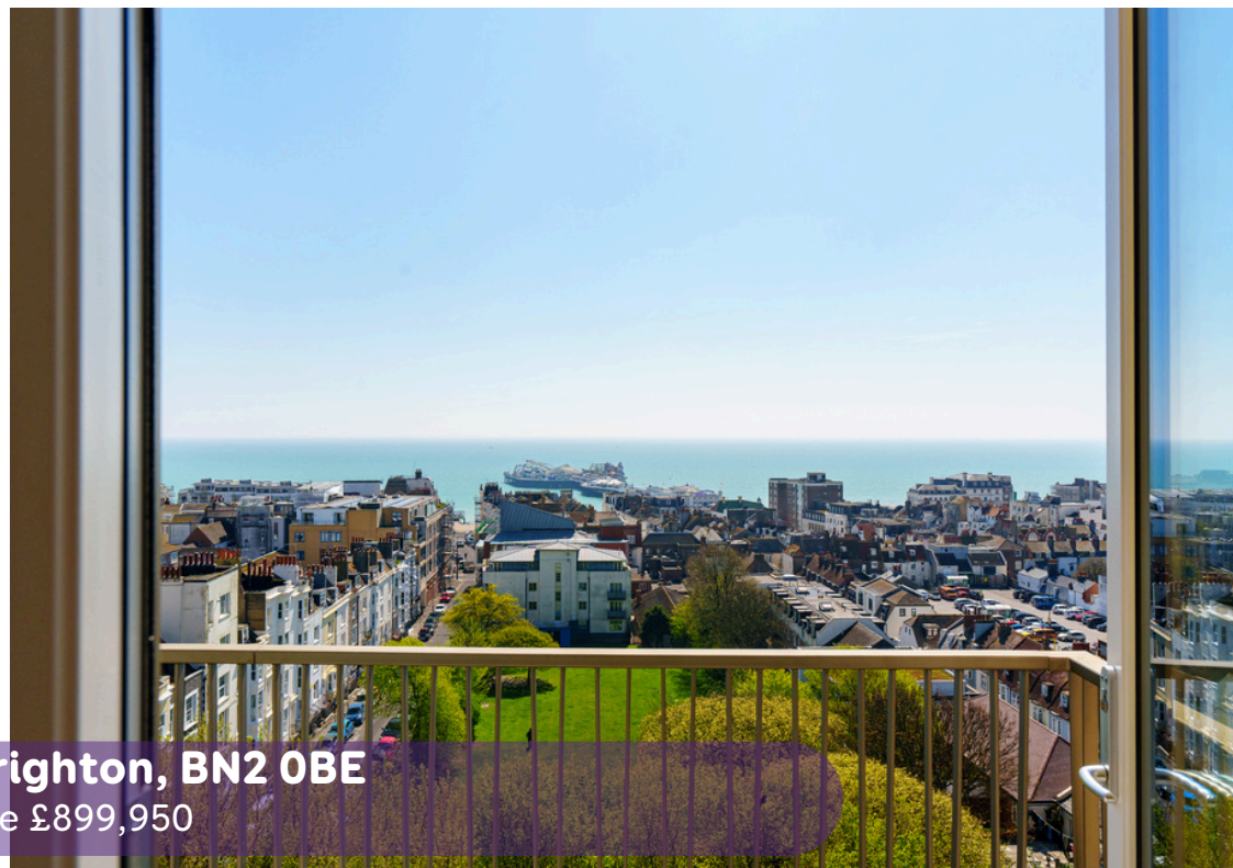
Edward Street, Brighton, BN2 0BE Asking Price £899,950