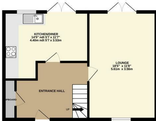
GROUND FLOOR 479 sq.ft. (44.5 sq.m.) approx.