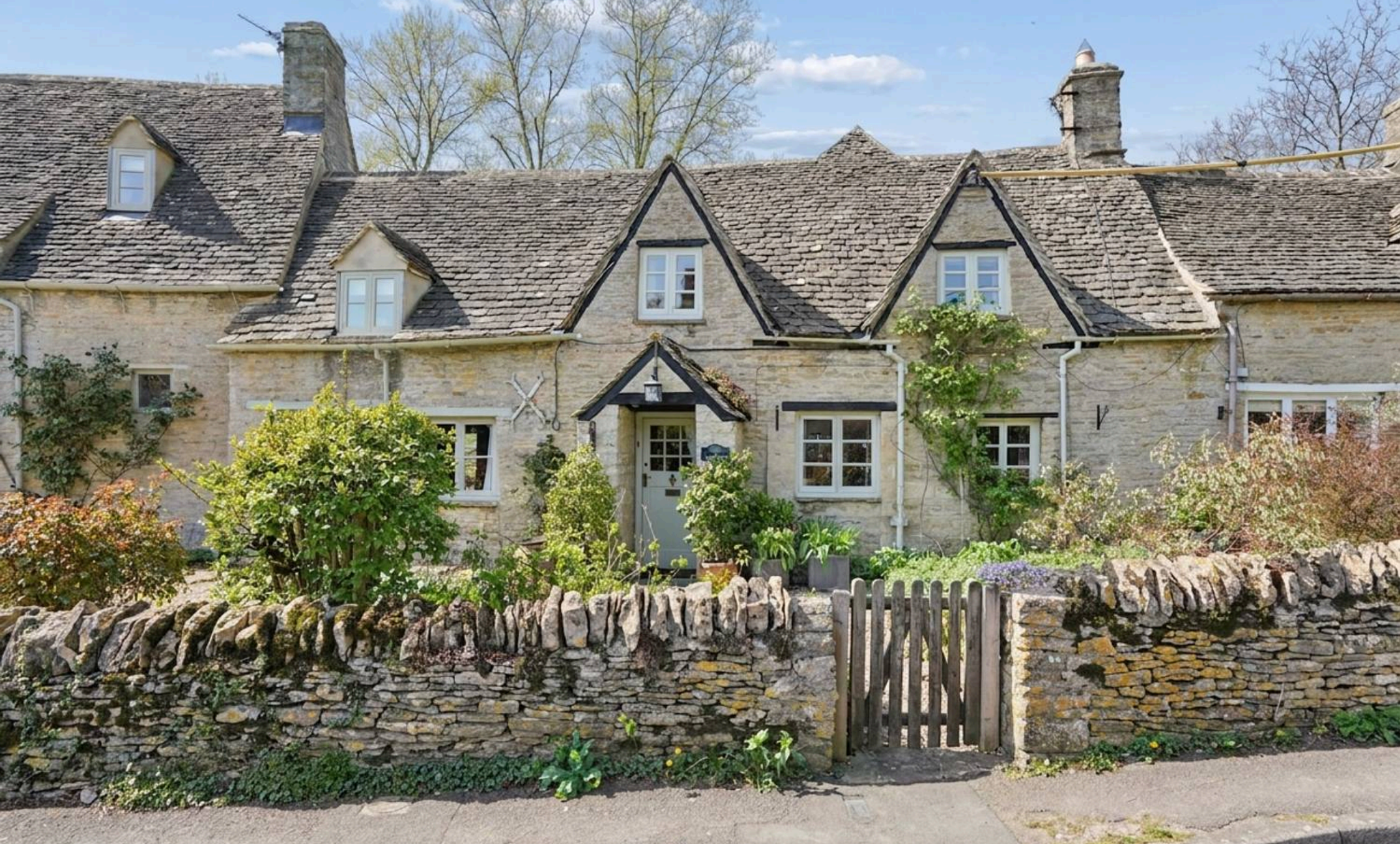
Linden, Witney Lane, Leaffield