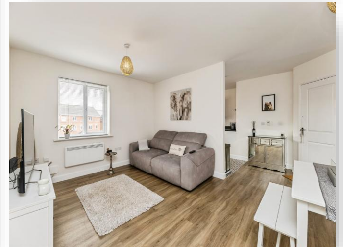
Woodside Court, Middleton LEEDS LS10 4US