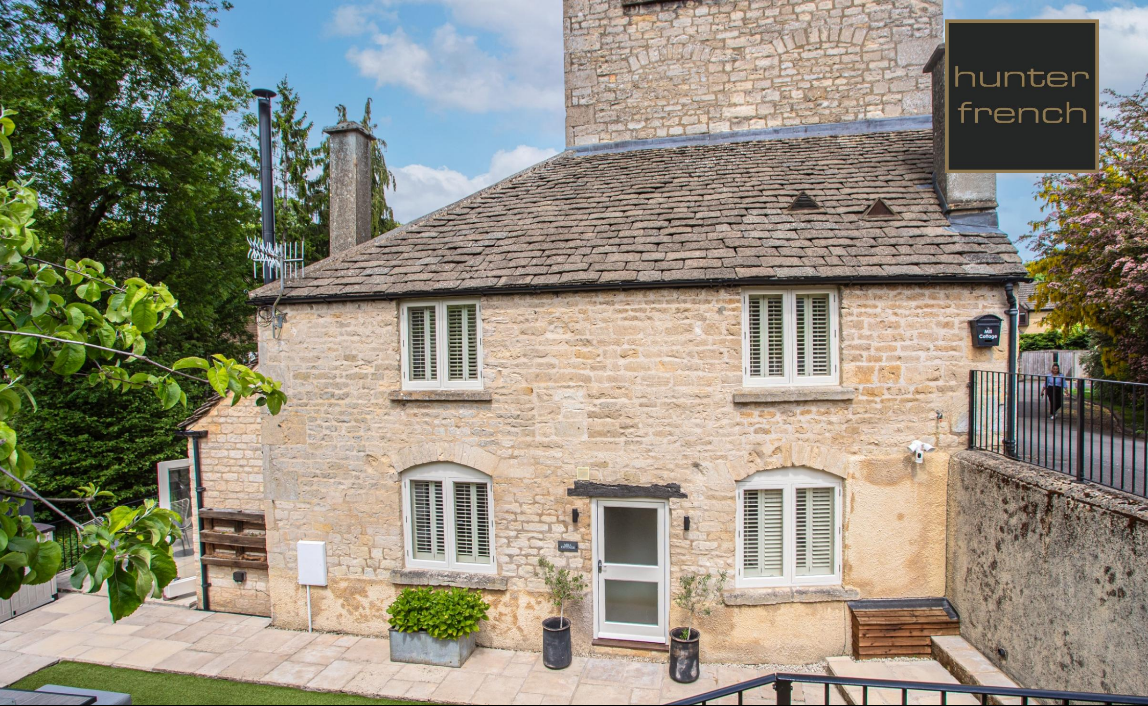
Mill Cottage, Mill Lane, Avening, Tetbury, Gloucestershire, GL8 8PD