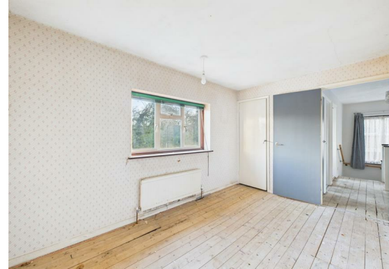
Entrance Lobby 4'2" x 4'0" (1.29m x 1.24m)