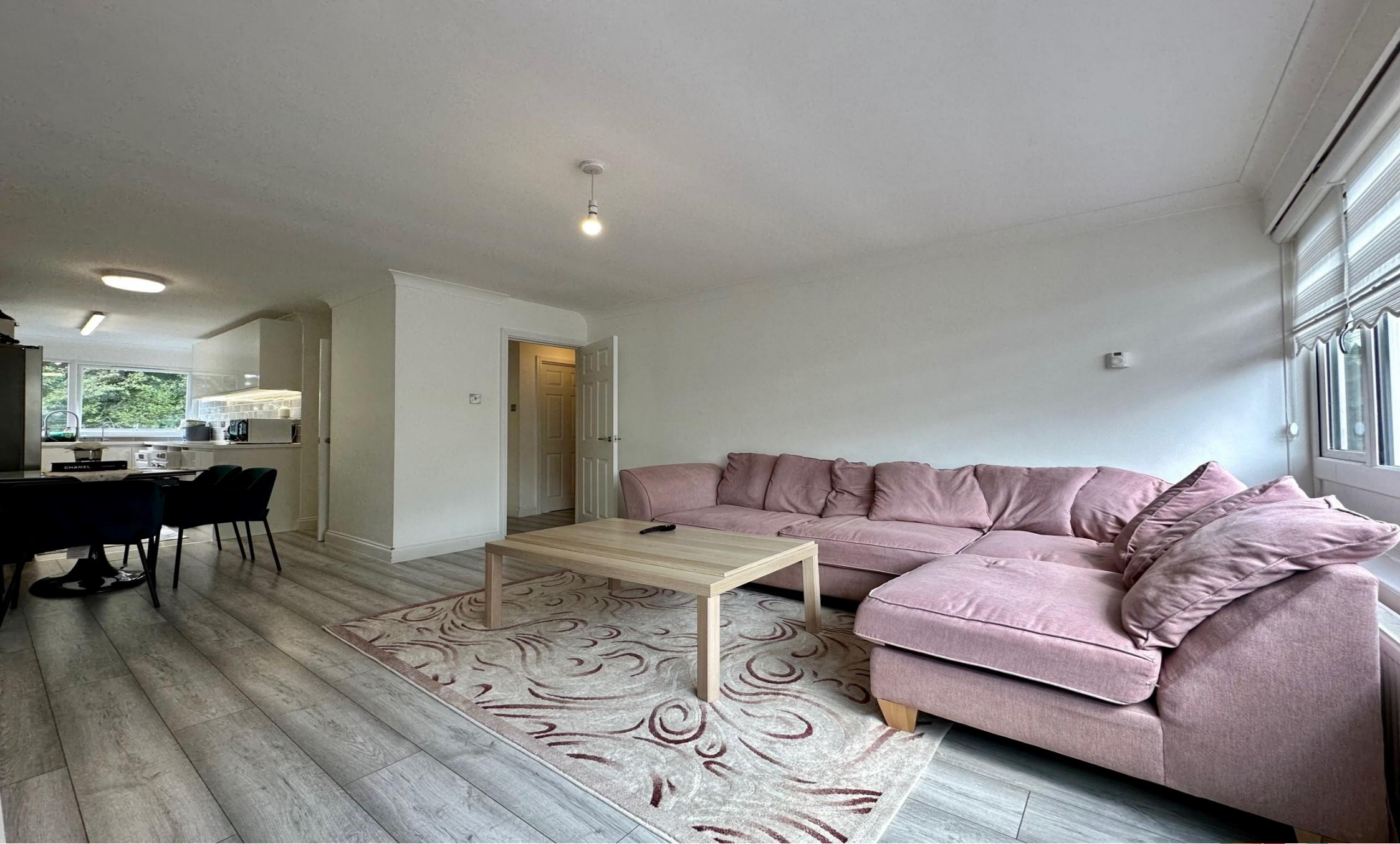
Cawdor House, Cameron Close, Warley, Brentwood, CM14 5BZ