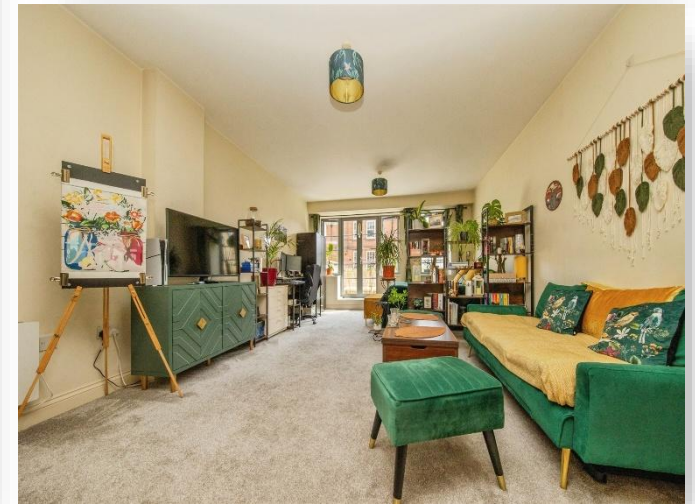
The View, Museum Street, Colchester, CO1 1BE