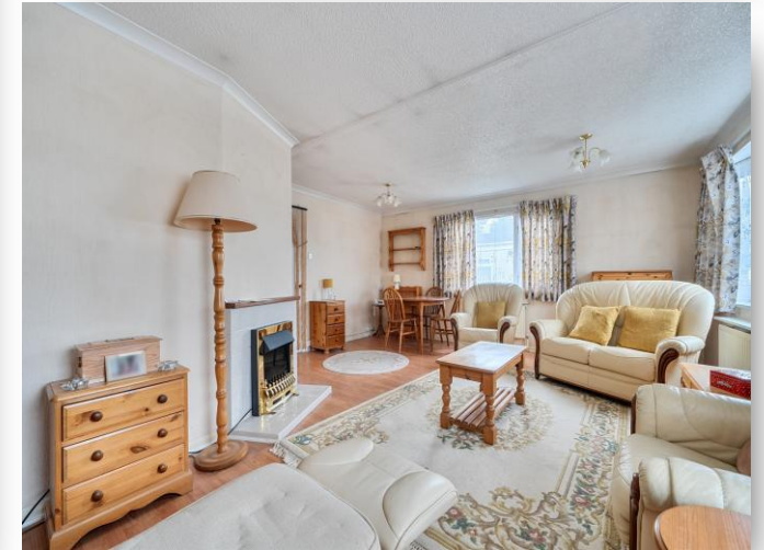
64 Strande Park, Cookham, Maidenhead SL6 9DX