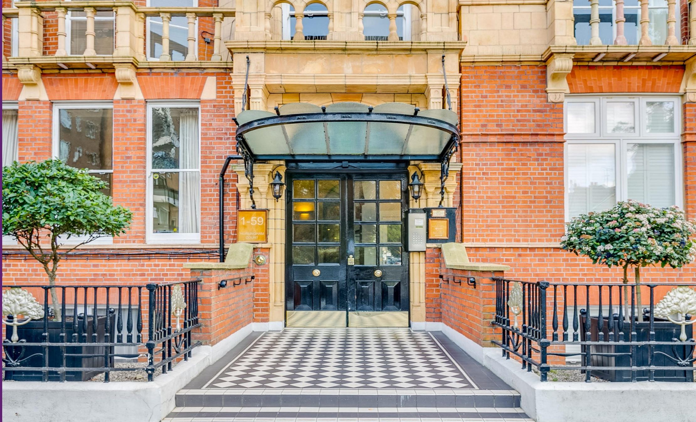
Hurlingham Court Ranelagh Gardens, SW6