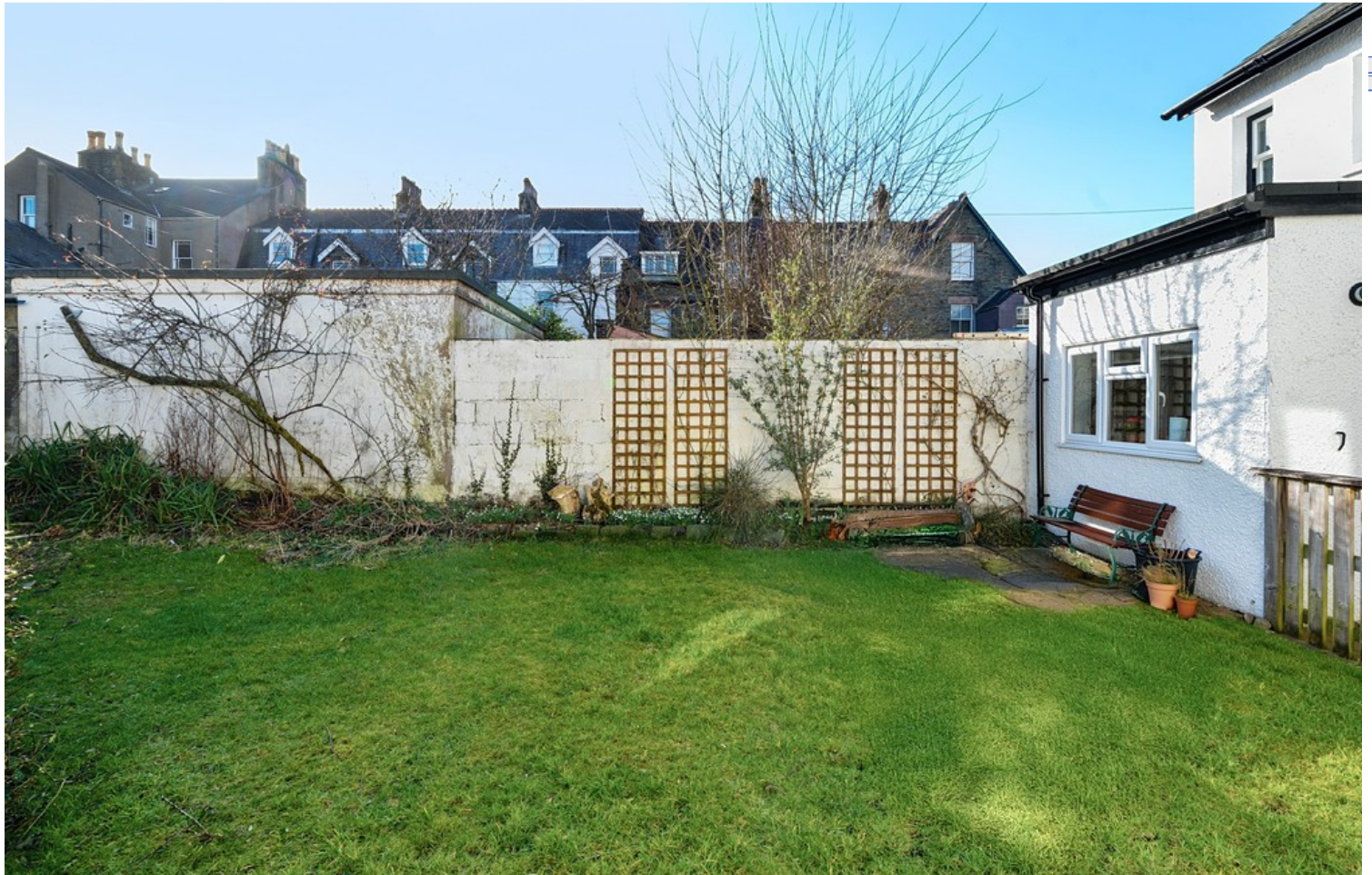
Shared Rear Garden

Request a Viewing Online or Call 01768 741741