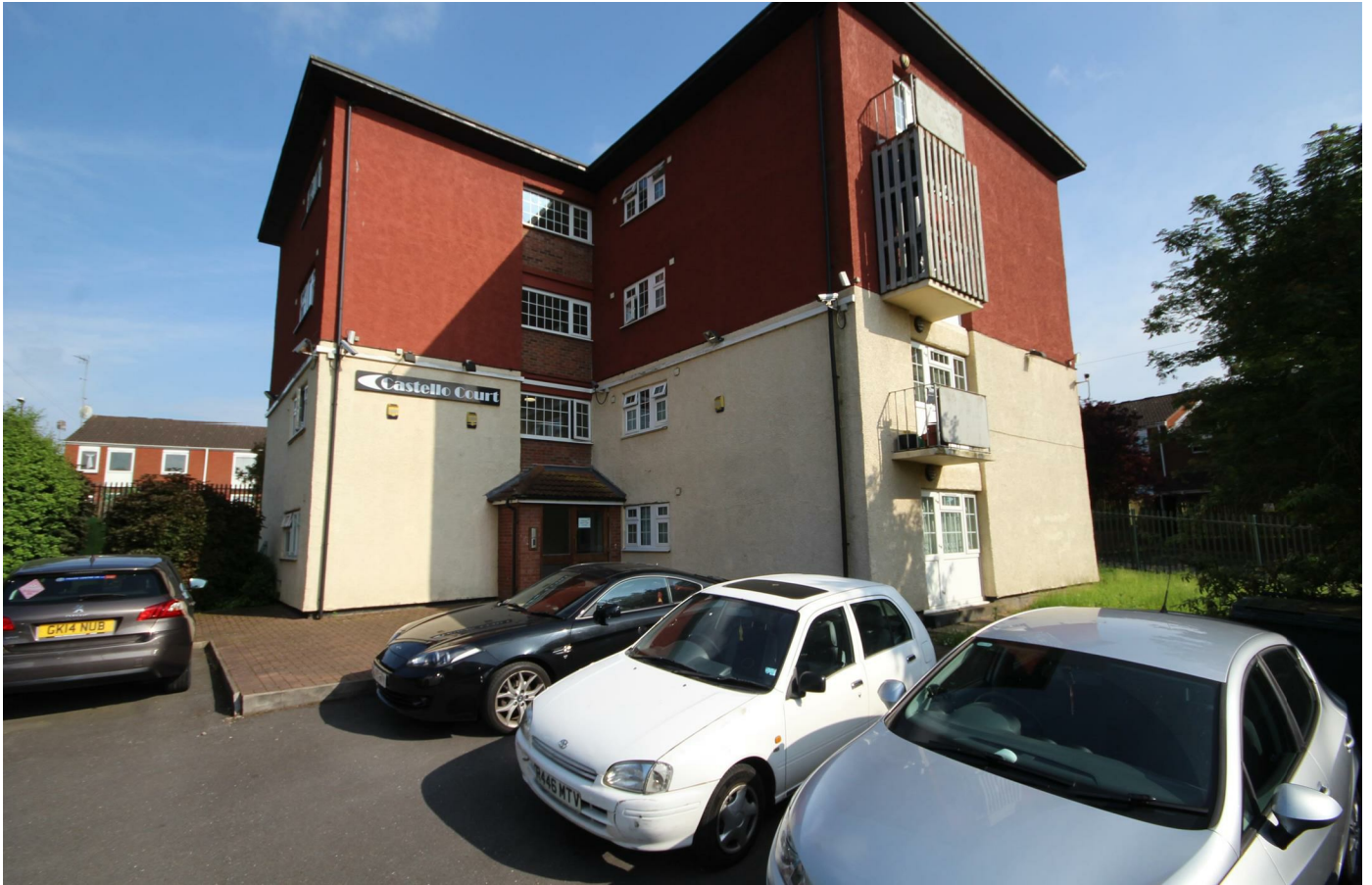
Tarquin Close, Coventry