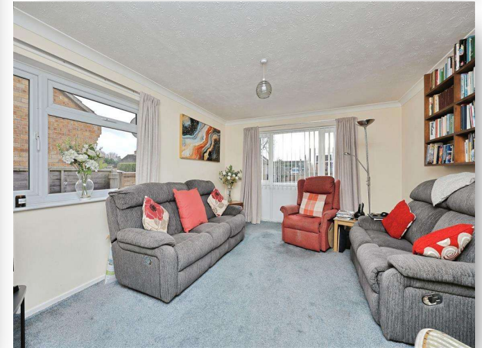
Lime Tree Close, Mattishall, Dereham NR20 3PP