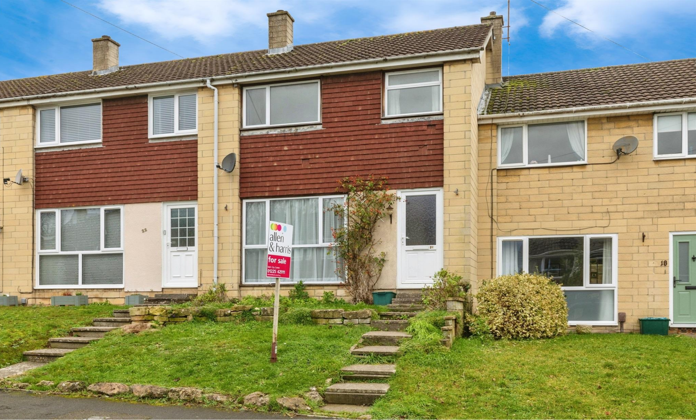
Hillcrest Drive, Bath BA2 1HE