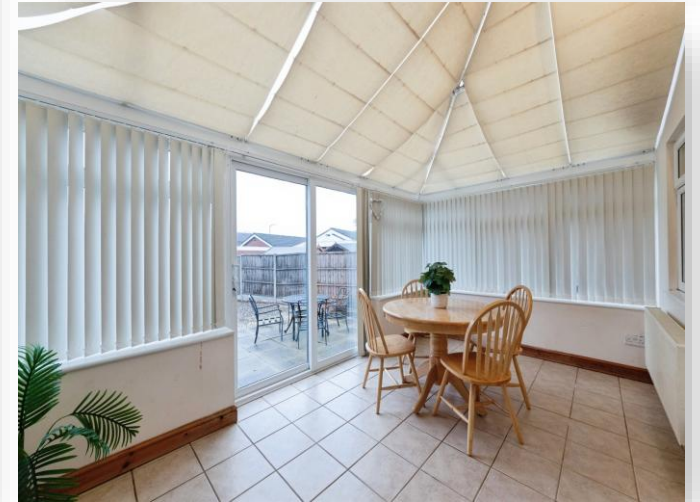
Bellington Croft, Shirley Solihull B90 4XP