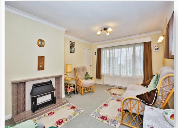
Stone Lane, Yeovil, BA21 4NN