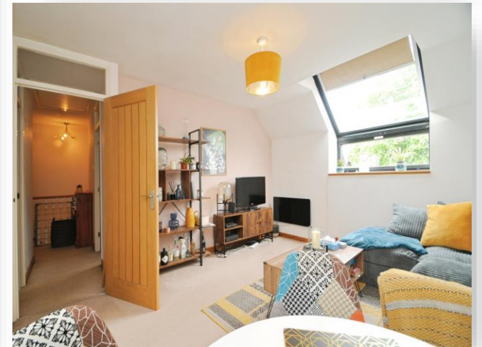
Royal Stables Woodfield Drive, Harrogate HG1 4LR