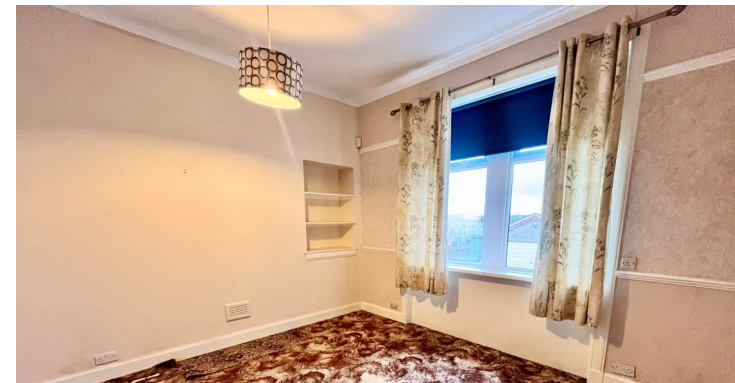
16 Russell Street