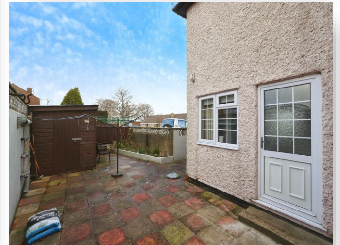
15 Larkhill Road, Durrington Salisbury SP4 8DR