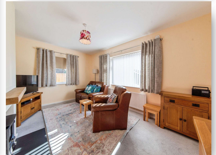
The Link, Leasingham Sleaford NG34 8JX