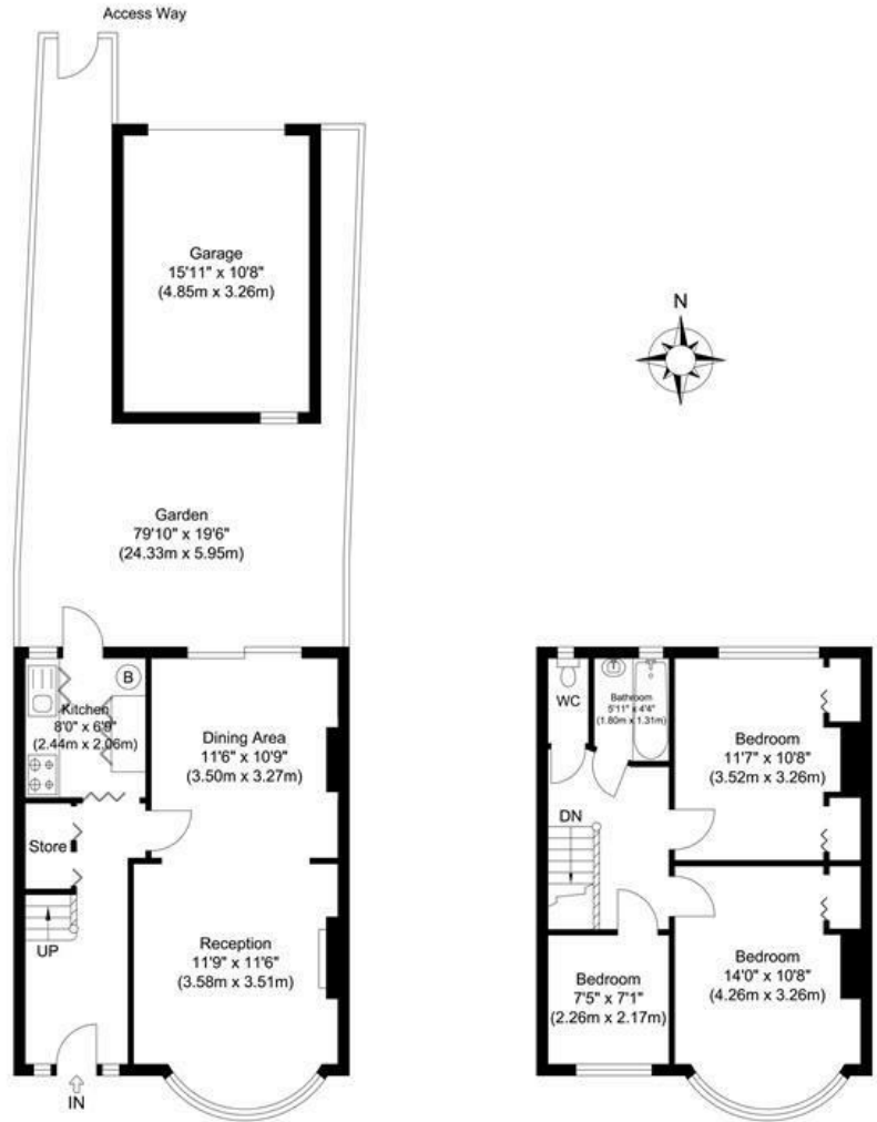
Ground Floor Approximate Floor Area 435.61 sq. ft. (40.47 sq. m)