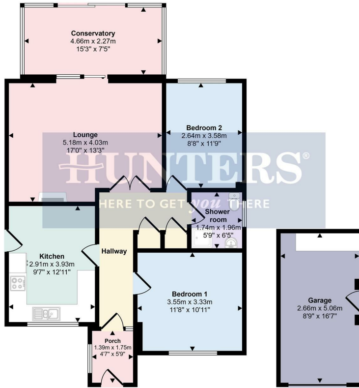
Floorplan Approx 83 sq m / 894 sq ft

Approx Gross Internal Area 97 sq m / 1039 sq ft