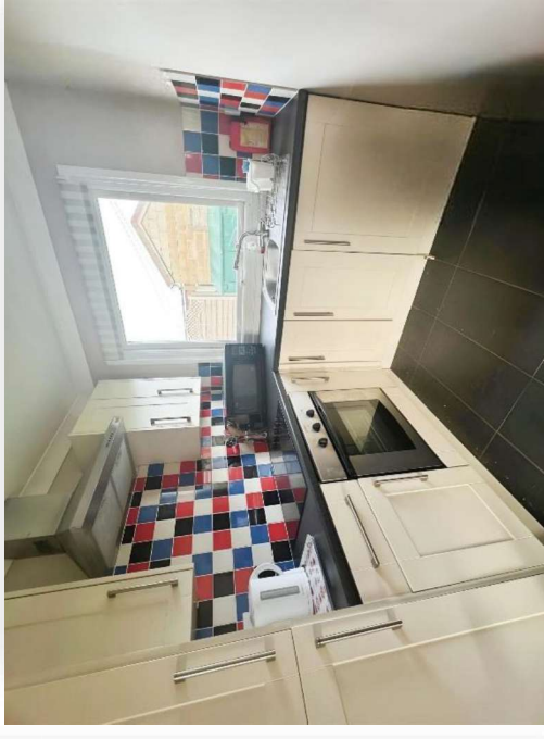
Rainbows End Chalet Park, Mill Lane, Bacton NR12 0HN