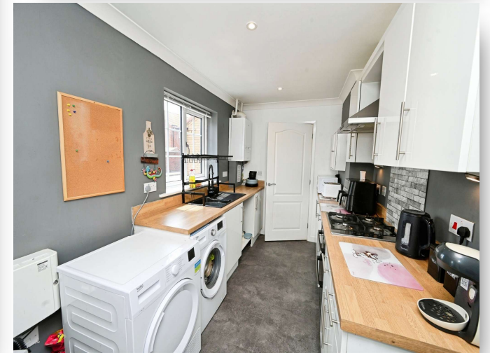
Curtis Drive, Coningsby Lincoln LN4 4DU