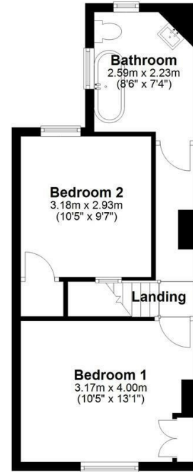
First Floor Approx. 35.1 sq. metres (377.8 sq. feet)