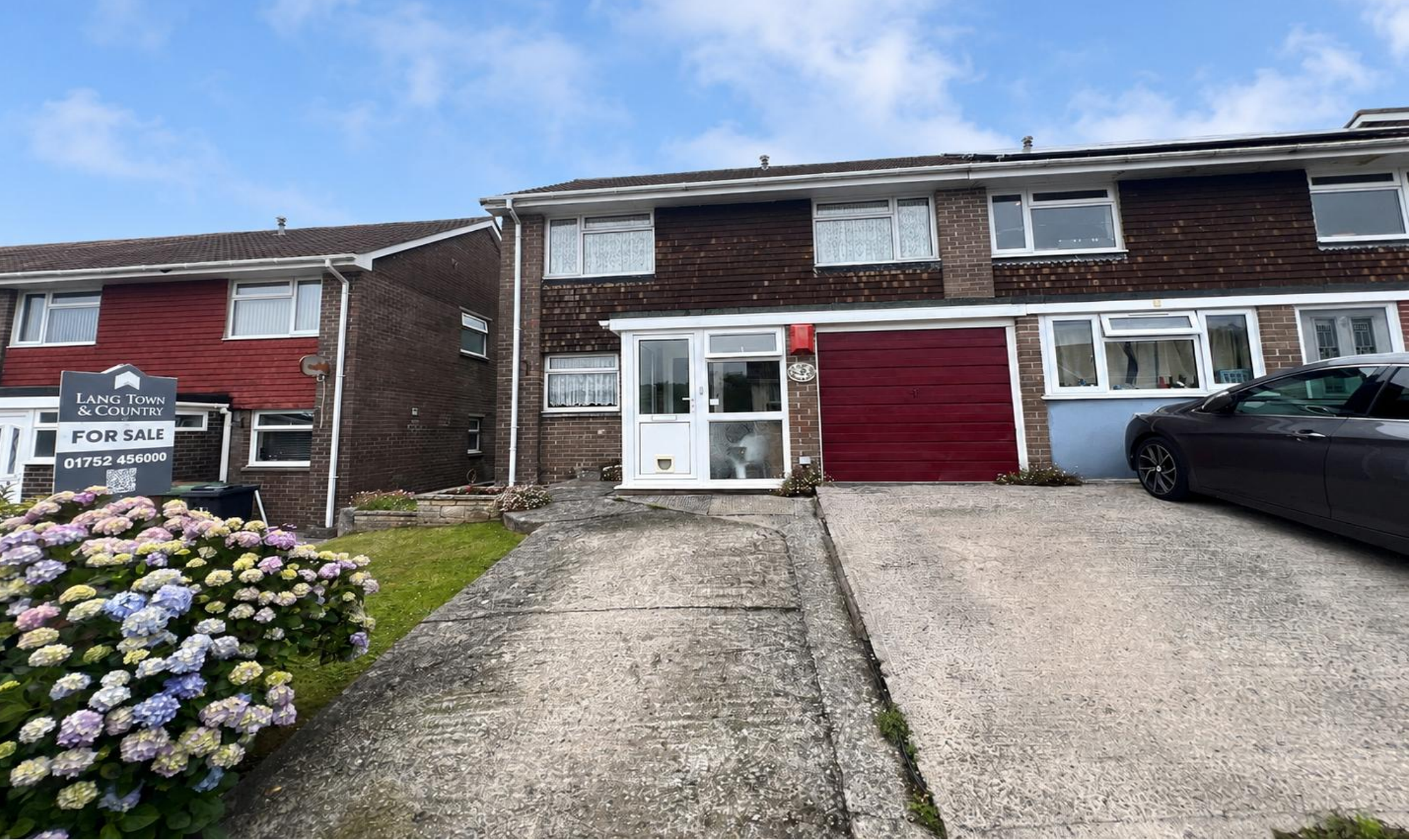
3 Budleigh Close, Goosewell, Plymouth, Devon, PL9 9JF