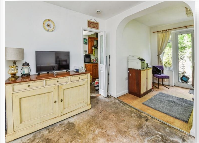
Wynsome Street, Southwick Trowbridge BA14 9RB