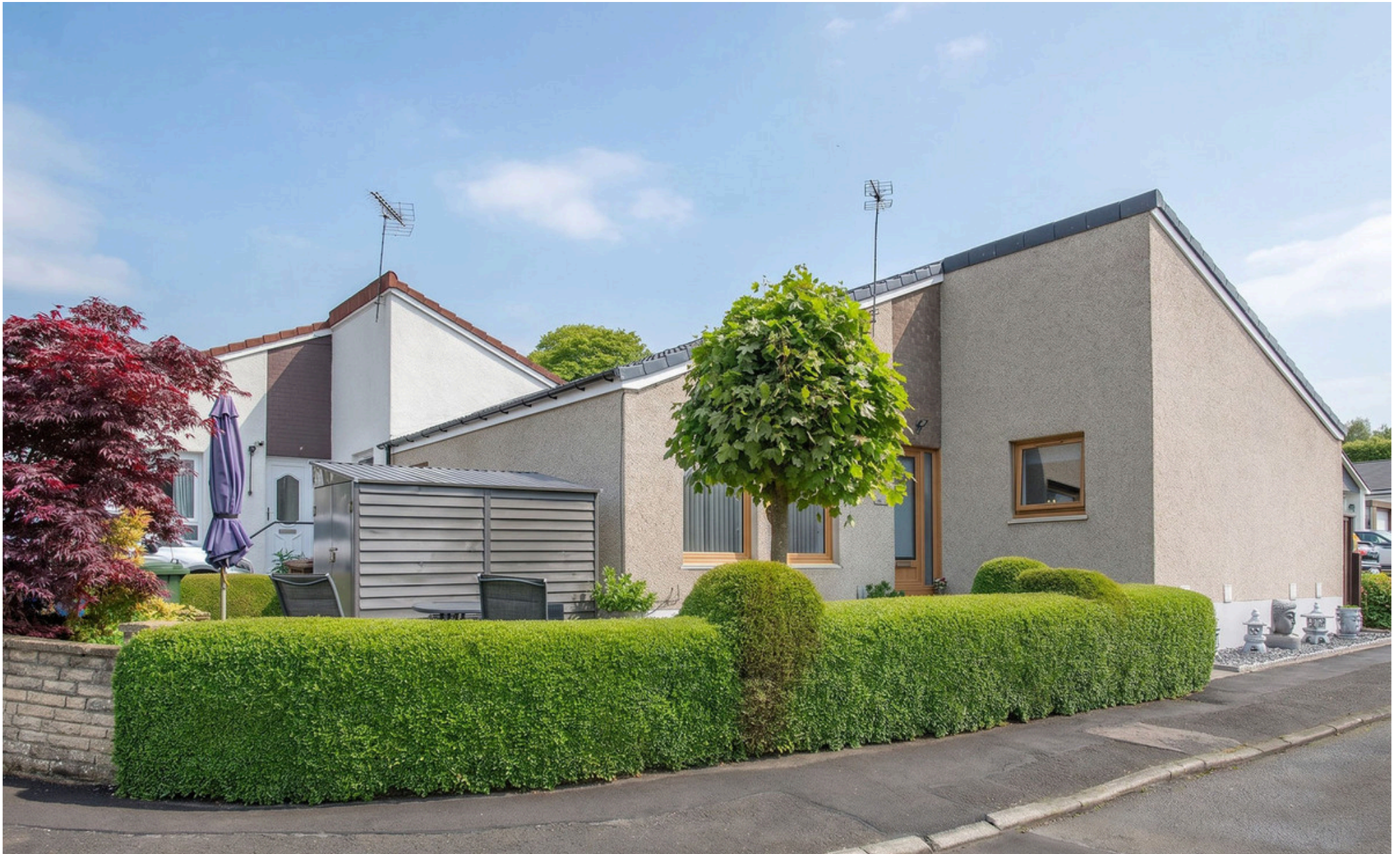
6 Brewlands Court, Dollar FK14 7AU