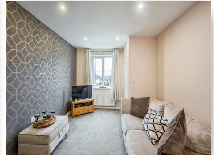
Shafton Gate, Goldthorpe Rotherham S63 9GJ