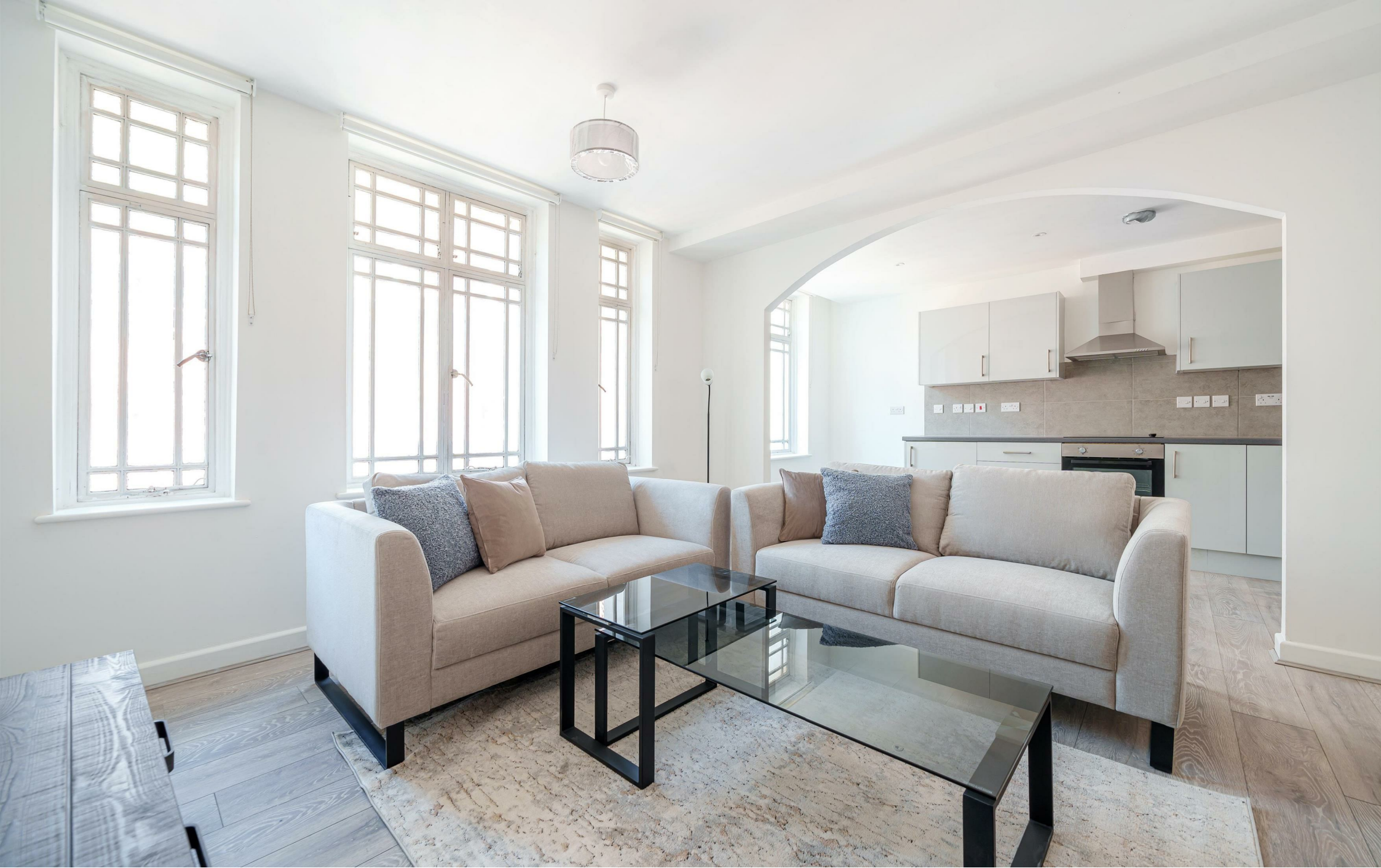
Flat 8 Cheltenham House Bristol, BS1 1YA £2,000 Per Month