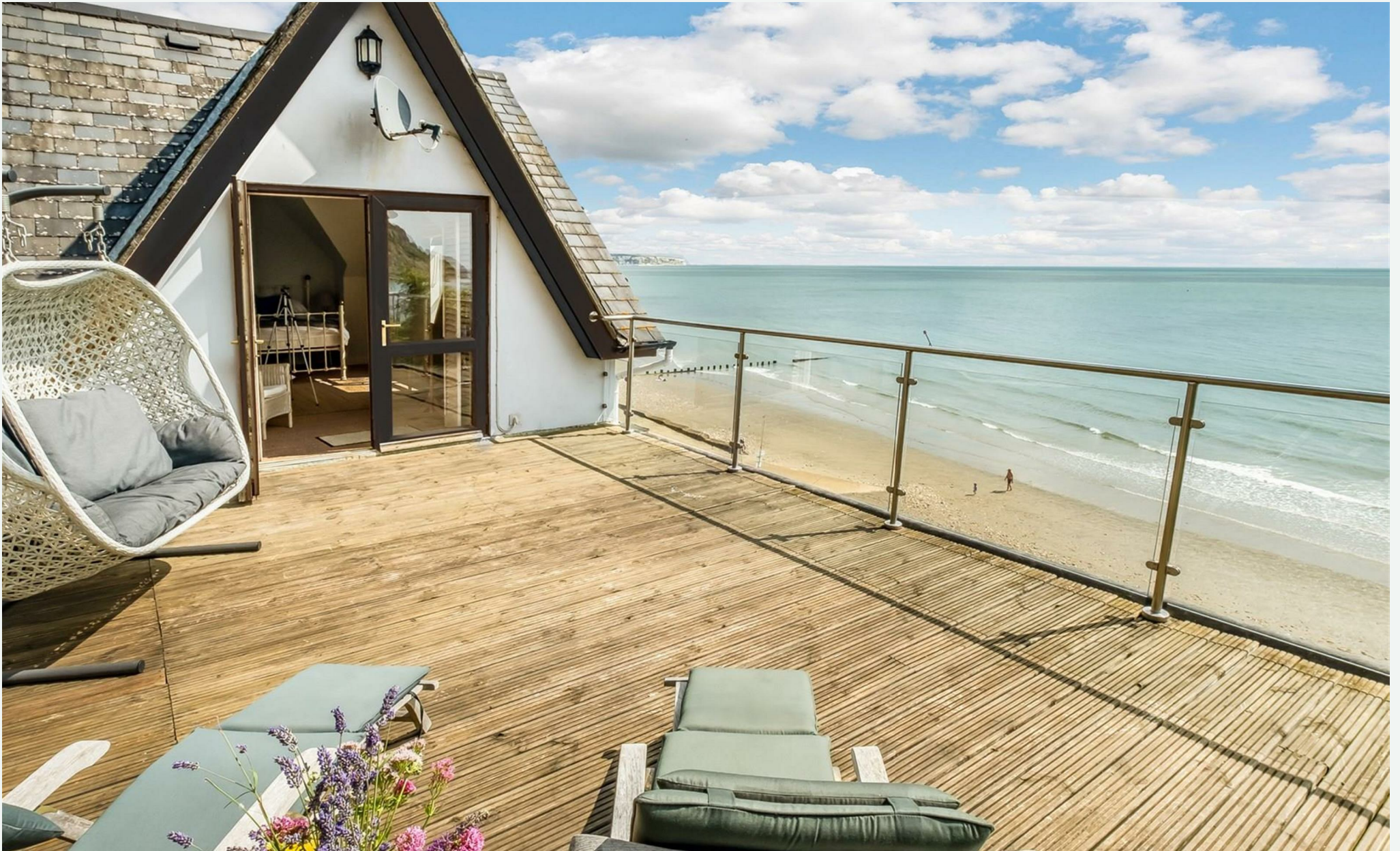
The Sea Terrace, 2 Esplanade, Shanklin, Isle of Wight, PO37 6BN