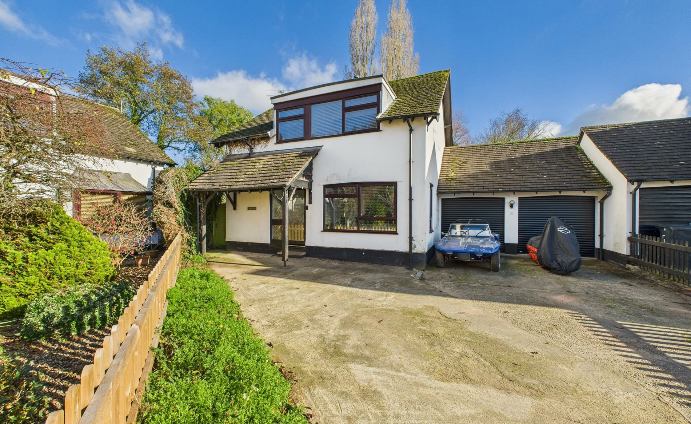
6. Stoneylands, Rockbeare, Exeter, EX5 2EW Price Guide £550,000