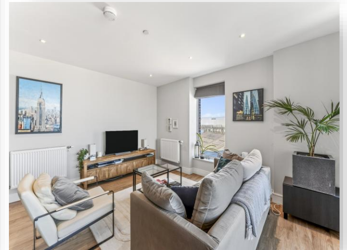
Bushane Court, Greyhound Parade, London SW17 0SJ