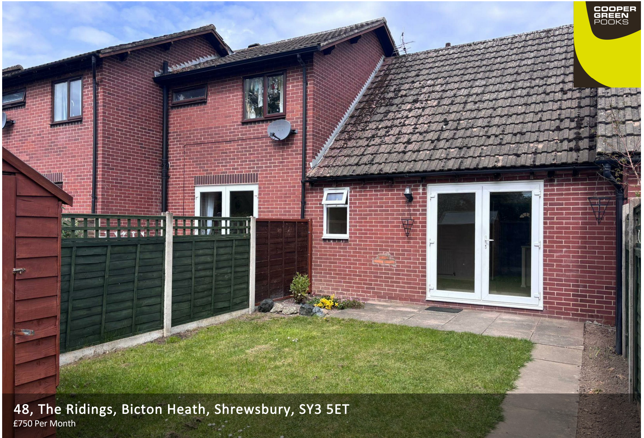
48, The Ridings, Bicton Heath, Shrewsbury, SY3 5ET £750 Per Month