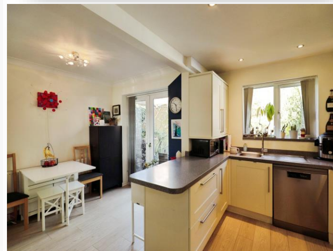
Bluebell Walk, Harrogate HG3 2SJ