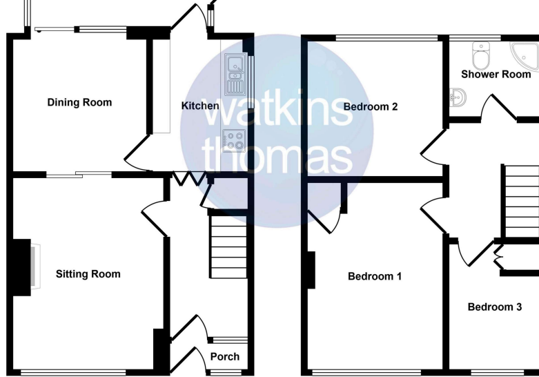
Ground Floor Approx 46 sq m / 500 sq ft

WATKINS THOMAS LTD registered in Cardiff, No: 8037310. These particulars are used on the strict understanding that all negotiations are conducted through WATKINS THOMAS LTD. MISREPRESENTATION ACT - 1967. WATKINS THOMAS LTD, for itself and for the Vendors of this property whose agent it is give notice that: 1. These particulars do not constitute, nor constitute any part of an offer or contract. 2. All statements contained in these particulars as to this property are made without responsibility on the part of WATKINS THOMAS LTD or the Vendor. 3. None of the statements contained in these particulars as to this property are to be relied on as statements or representations of fact. 4. Any intending purchaser must satisfy himself by inspection or otherwise as to the correctness of each of the statements contained in these particulars. 5. The Vendor does not make or give, and neither WATKINS THOMAS LTD nor any person in its employment has authority to make or give any representation or warranty whatever in relation to this property.