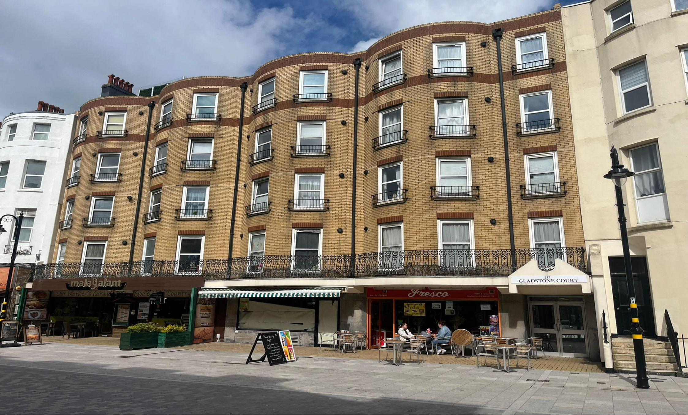
Gladstone Court Terminus Road, Eastbourne BN21 3DH