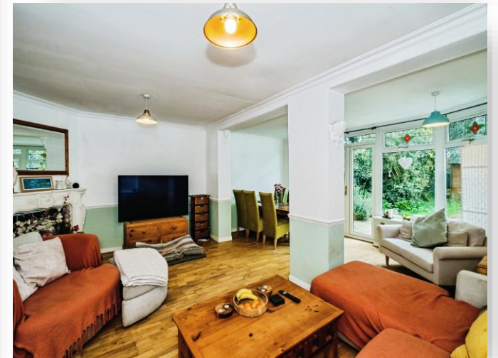
Grinstead Lane, Lancing BN15 9DT