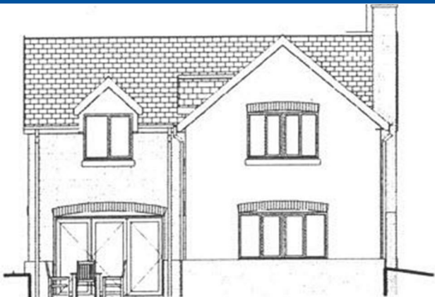
Proposed southwest elevation

Superbly located close to the River Wye, this desirable building plot comes with Detailed Planning Permission for a four-bedroom detached home. Beautiful gardens and open views make this an excellent investment or self-build opportunity.