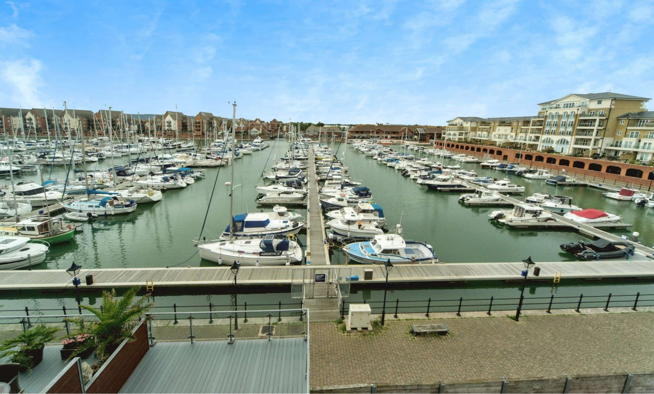
Palomar Court Midway Quay, Eastbourne BN23 5DE